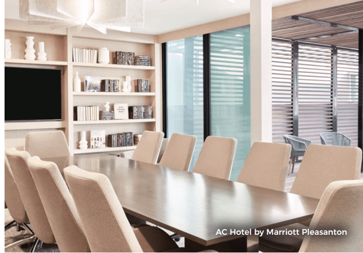
AC Hotel by Marriott Pleasanton