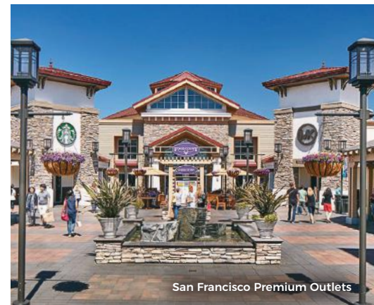
San Francisco Premium Outlets