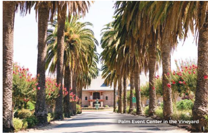
Palm Event Center in the Vineyard