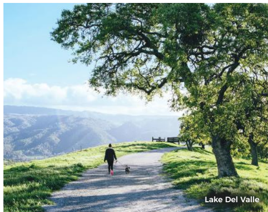
Lake Del Valle