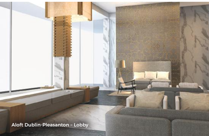
Aloft Dublin-Pleasanton - Lobby

Bay Area Rapid Transit System (BART) is the leading transportation system with convenient stops in Dublin and Pleasanton directly from San Francisco and Oakland airports.